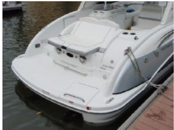
> Stern Seating