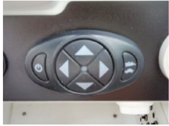
> Bow Light Remote