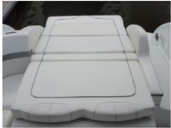
> Transom Sun Pad