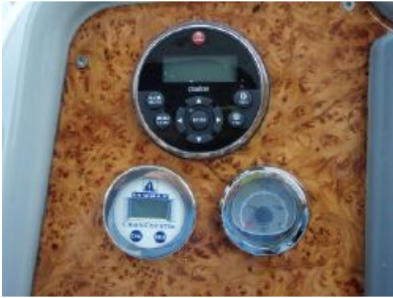
> Clarion Remote