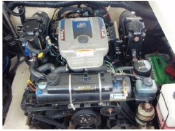
> Starboard Mercruiser