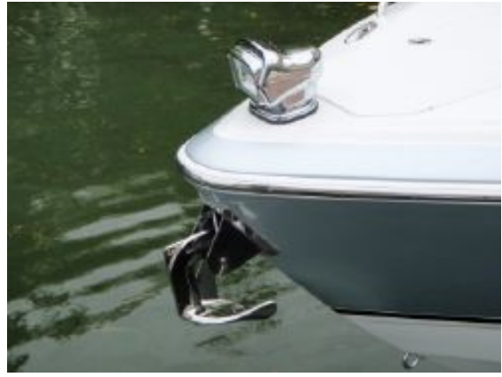
> Bow Light & Windlass