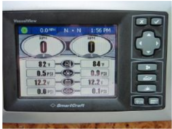
> Vessel View