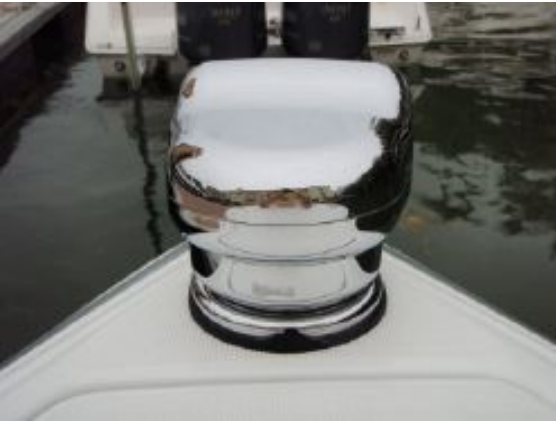
> Bow Light