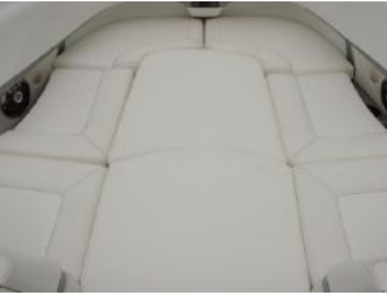
> Bow Cushions