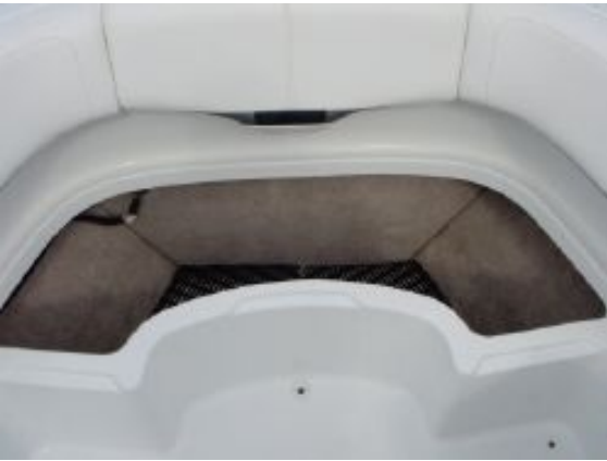
> Bow Storage