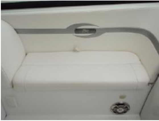
> Port Side Seat With Storage