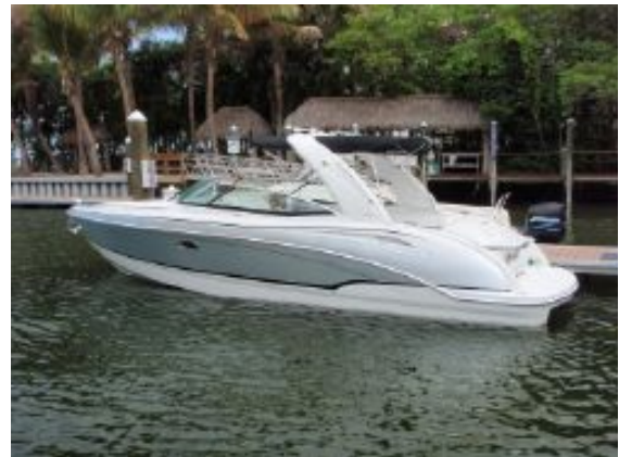
> Port Profile