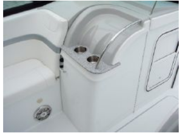
> Door To Head