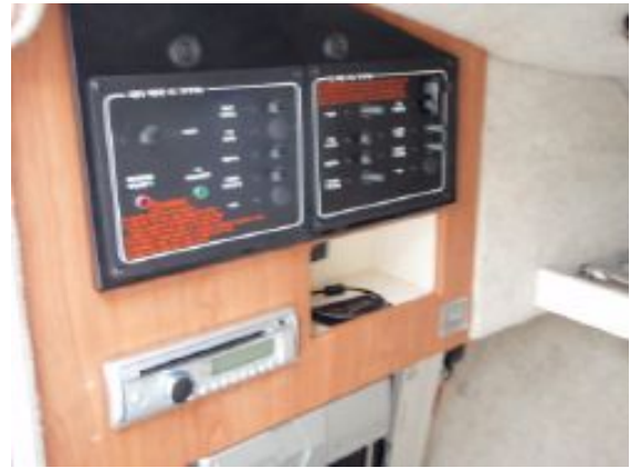
> AC System & DC Systems & Stereo