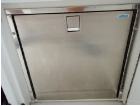
> Cockpit Fridge