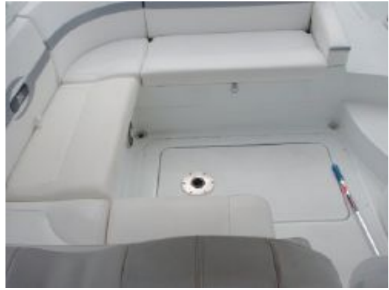
> Cockpit Seating With Storage