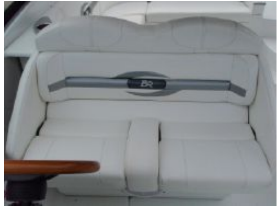
> Captains Seat