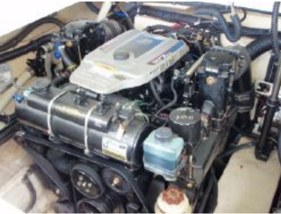
> Port Mercruiser