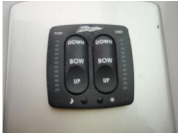
> Trim Tab Indicators