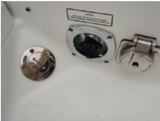
> Transom Electrical Hook Up