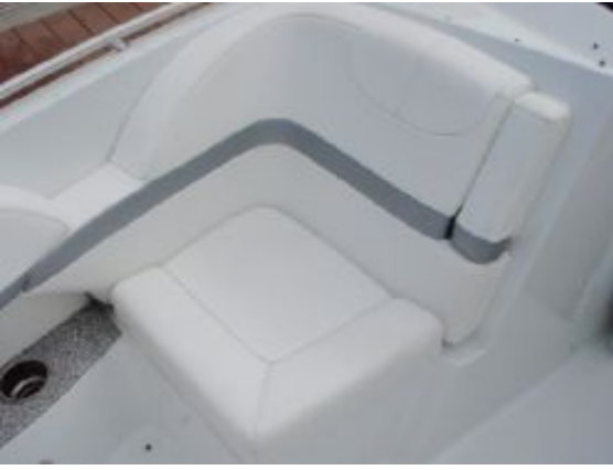
> Starboard Bow Seat