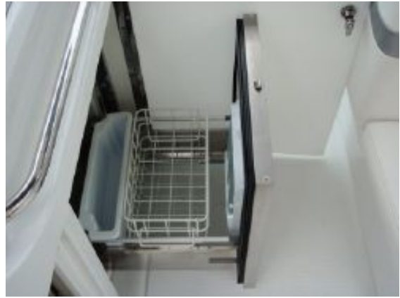
> Slide Out Cockpit Fridge