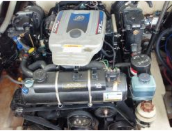
> Port Mercruiser