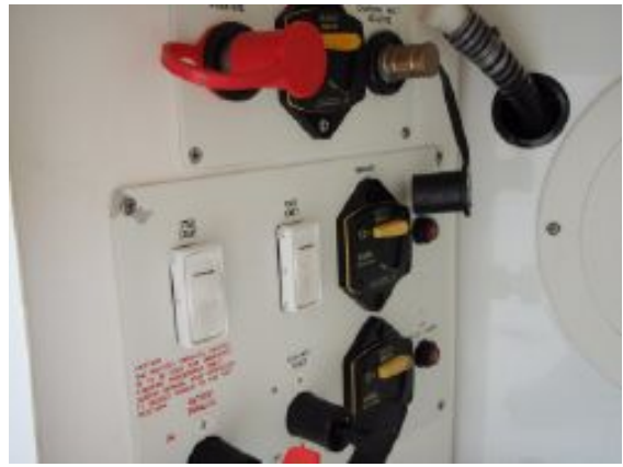
> Battery Switches