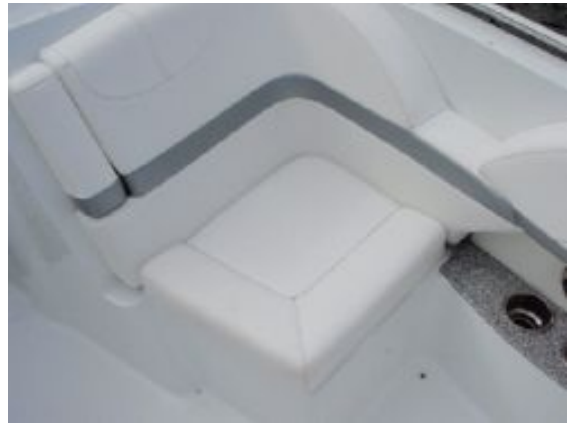
> Port Bow Seat