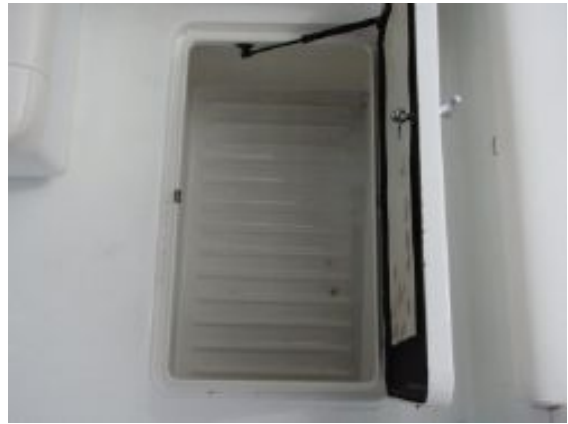
> Cockpit Sole Storage