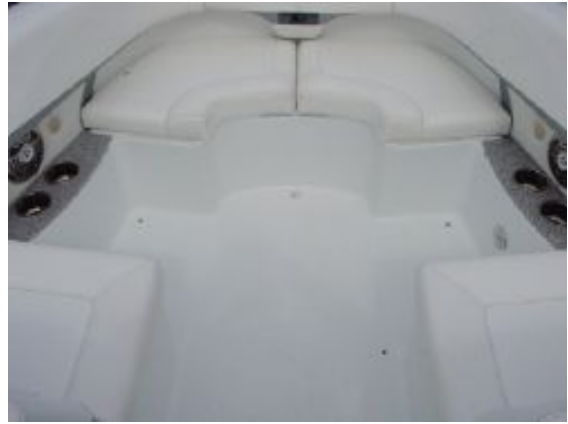
> Bow Seats Removed