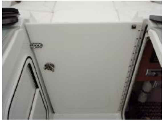
> Bow Door Divider