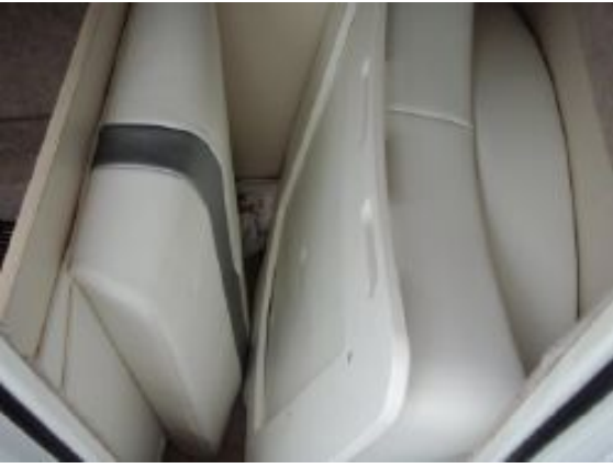
> Forward Seat Cushions Storage