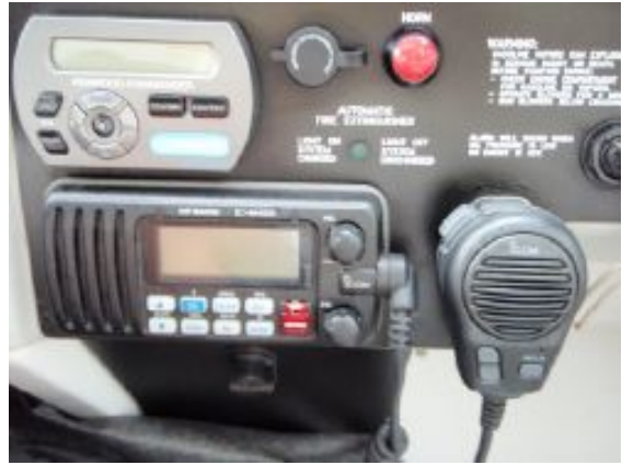
> Icom VHF & Kenwood Remote