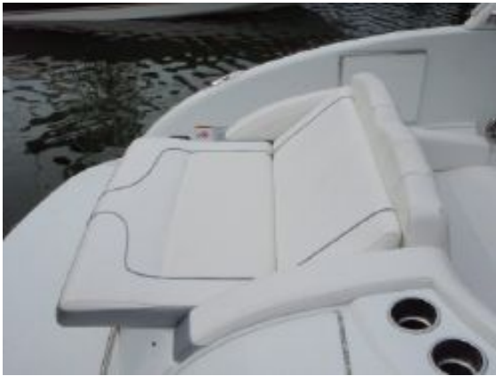
> Stern Seating