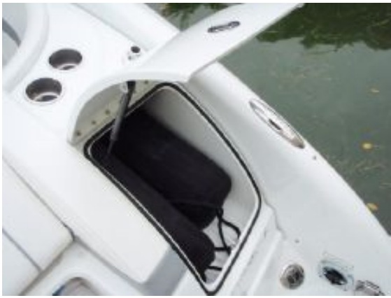
> Transom Fender Storage & Cup holders