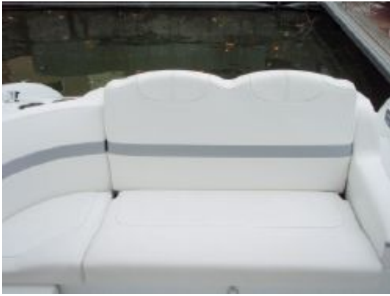
> Aft Cockpit Seat With Storage