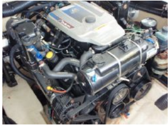
> Starboard Mercruiser