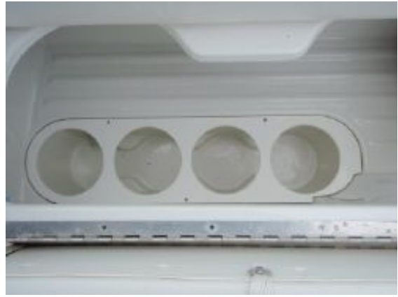
> Dedicated Fender Storage Under Port Seat