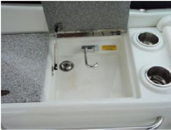
> Cockpit Wet Bar